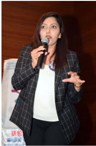
Ignite: Cancer - True & False