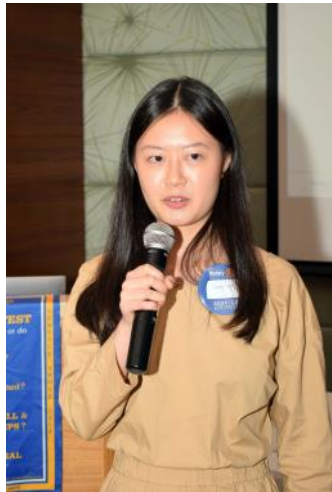
Ignite: Spacecraft & Satellite