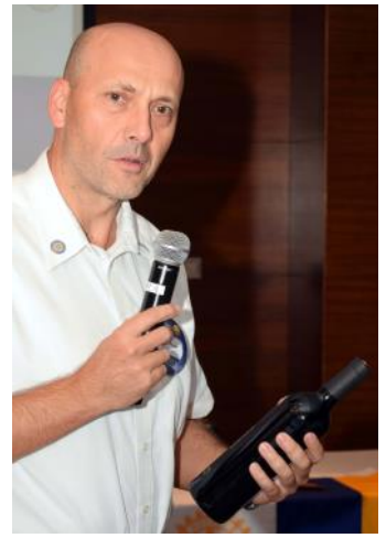
Ignite: Austrian Facts